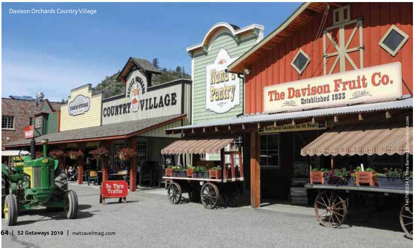
Davison Orchards Country Village

When you're ready to get some much-needed fresh air and exercise, the striking natural beauty in every direction offers plenty of opportunities. For golfers, the Predator Ridge Resort was created with great reverence for the spectacular natural setting. The resort is also home to fine dining, a state-of-the-art fitness center and miles of biking and walking trails. To work up more of a sweat, the Okanagan Rail Trail boasts