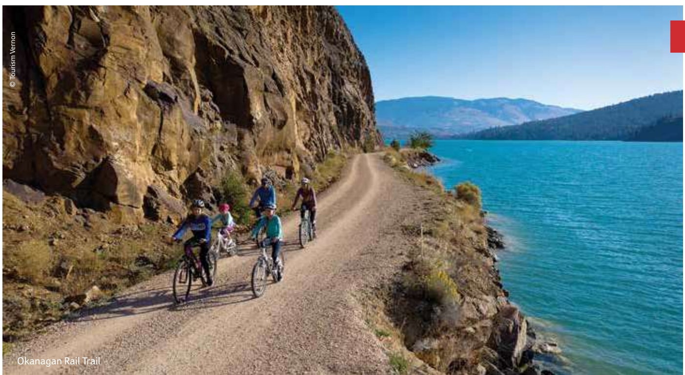
Okanagan Rail Trail

surroundings by incorporating a natural creek as a key element of its design. With more than 1,000 plants and a pool, the lodge's atrium is a great place to unwind. Plus there's a bar there, so it's like a classy, Canadian Pirates of the Caribbean for grownups.